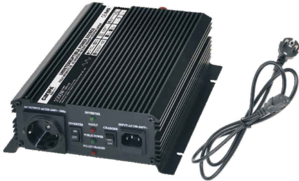
AC Output Receptacles(optional)